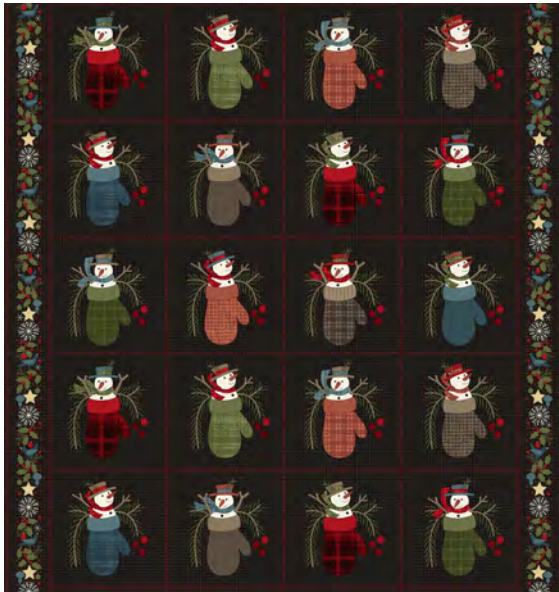
Snowmen Blocks 10891-J