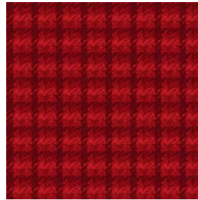
Red Plaid Border F10896-R

*enough for 5 full rows plus seam allowance