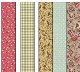
Strip Set 1 - Make 2

Each block will measure a 10.5" square after sewn together.