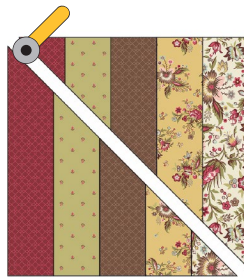
Strip Set 3 Cut 2 for 4 triangles

5. Follow the A Block steps 1-3 using the remaining (10) 10" strips to make a total of 2 B blocks.