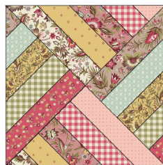
A Blocks Make 2 14-1/2" x 14-1/2"