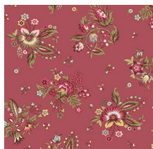
Fabric 3 MAS11041-R