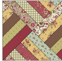
B Blocks Make 2 14-1/2" x 14-1/2"

6. Assemble the table runner as shown below alternating the blocks and sashing. Press. A table runner with 4 blocks and 3 sashing strips will measure 14.5" x 58".