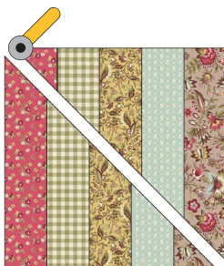
Strip Set 1 Cut 2 for 4 triangles

2. Cut each strip set in half from corner to corner to make 4 triangles