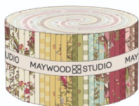
Fabric 1 ST-MASFRMA