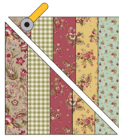
Strip Set 4 Cut 2 for 4 triangles