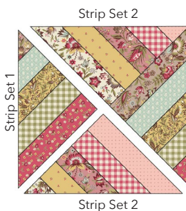
Strip Set 2

3. Rearrange the triangles and sew into pairs. Press. Sew the pairs together to form a block that measures 14.5" square. Press.