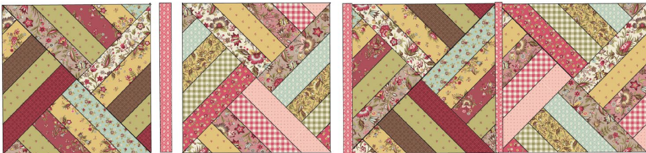
B Block F2 Sashing A Block F2 Sashing B Block F2 Sashing A Block

6. Assemble the table runner as shown below alternating the blocks and sashing. Press. A table runner with 4 blocks and 3 sashing strips will measure 14.5" x 58".