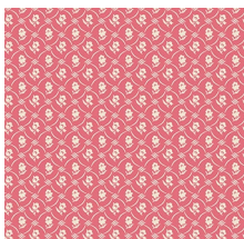
Fabric 2 MAS11045-P