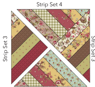
Strip Set 4