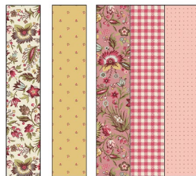
Strip Set 2 - Make 2

2. Cut each strip set in half from corner to corner to make 4 triangles