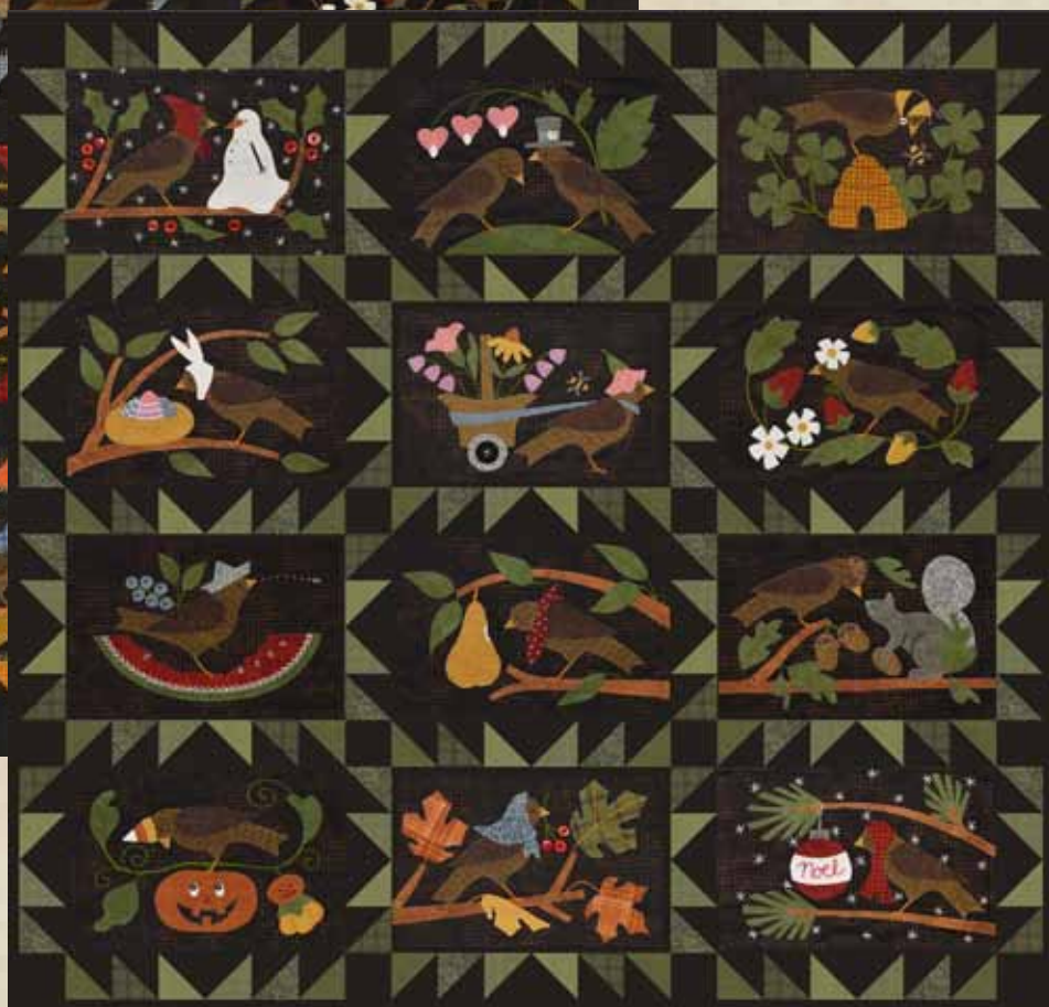
Option 2 approx size 46" x 44"