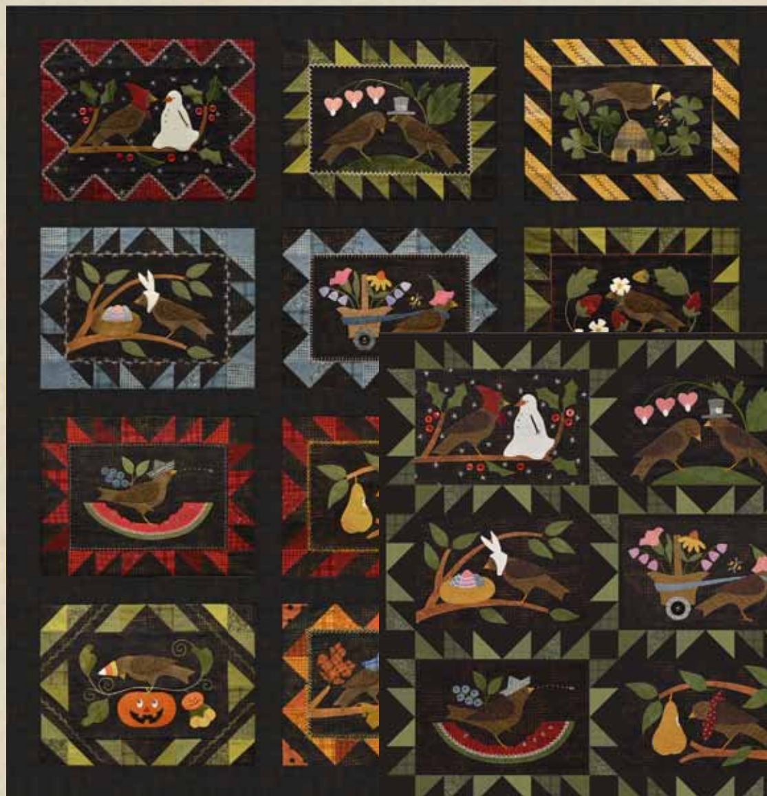
Option 1 approx size 53" x 60"